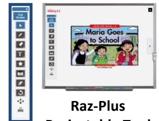
Raz-Plus Projectable Tool

To access the Projectable Tool in Raz-Plus, click Resources > Leveled Texts > Books & Passages . Then, select a title and go to Book Resources > Projectable .