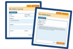
Word Journal and Reflection Journal

Seesaw Tip: Create a new Activity and type out the content students need to learn. Attach the literacy lesson video you recorded as an upload in multimedia instructions. Direct students to watch the video and respond to the Activity with a reflection about the lesson. Include additional detailed directions for students to then use the annotation procedures you modeled in the lesson in their own assigned texts.