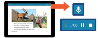
Student Recording Feature