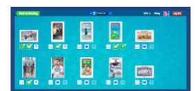
Level Up Area

Seesaw Tip: When creating the Activity, tell students how many self-choice books students should read each week. Direct them to create a book report for each book they read. Tell students to get creative with their book report presentations, using any of the Seesaw Response tools.