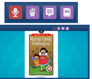
Raz-Kids Read eBook Preview

Google Classroom Tip: Use a tool such as Nimbus to record your video. Then, attach the videos to a Google Classroom assignment, add them to a Google Classroom Materials page, or place them in your Google Classroom Stream.