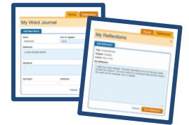
Word Journal and Reflection Journal

Google Classroom Tip: Use a tool such as Nimbus to record your video. Then, attach the videos to a Google Classroom assignment, add them to a Google Classroom Materials page, or place them in your Google Classroom Stream.