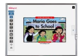
Raz-Plus Projectable Tool