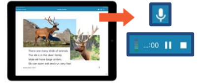
Student Recording Feature