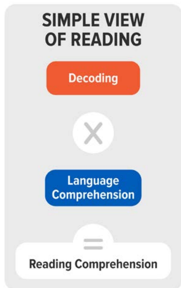
Figure 2. Simple View of Reading adapted from Gough and Tunmer (1986).

A similar view of skilled reading is evident in Simple View of Reading (1986) which suggests reading comprehension includes both decoding and language comprehension (see Figure 2). According to Gough and Tunmer, if either process breaks down, comprehension cannot occur. Based on the Simple View of Reading , reading comprehension depends on listening comprehension.